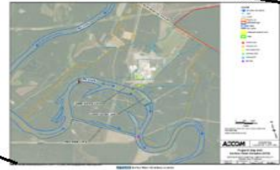
Combination map showing facility in relation to Congaree River and Fish Study Area